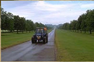
• FARM MACHINERY