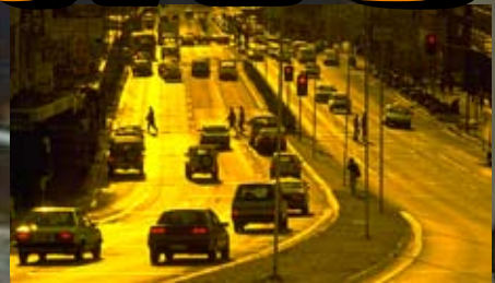
• PASSENGER VEHICLES