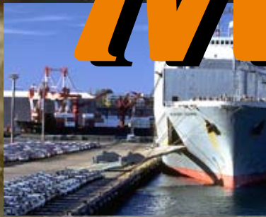
• TRUCKS • BUILDINGS • SHIPPING • TRAINS